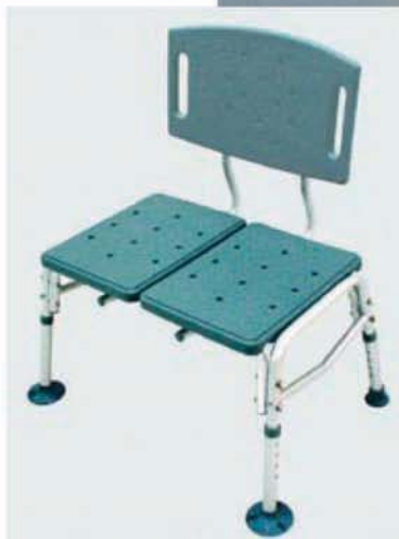
Transfer Tub Bench