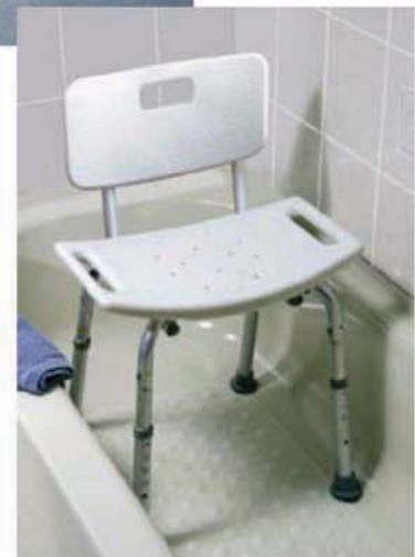
Tub Seat/Shower Chair