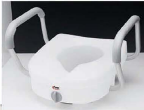
Elevated Toilet Seat With Rails