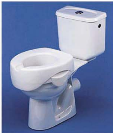
Elevated Toilet Seat